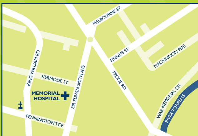
Sir Edwin Smith Avenue, North Adelaide