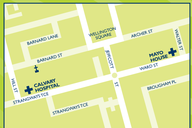
89 Strangways Terrace, North Adelaide

Appointments and Enquiries 8402 0200 Toll Free 1300 732 270